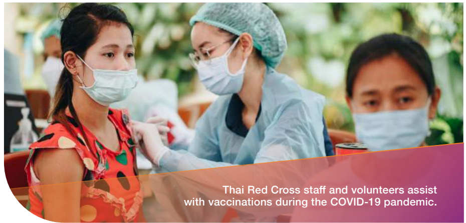
Thai Red Cross staff and volunteers assist with vaccinations during the COVID-19 pandemic.

“We considered how this emergency would be managed, as in many cases, health ministries managed