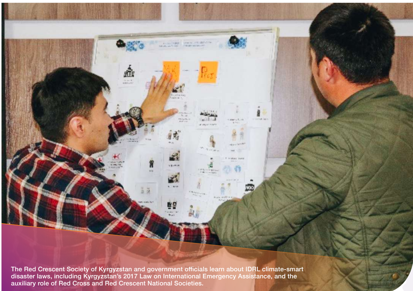
The Red Crescent Society of Kyrgyzstan and government officials learn about IDRL climate-smart disaster laws, including Kyrgyzstan's 2017 Law on International Emergency Assistance, and the auxiliary role of Red Cross and Red Crescent National Societies.

a regulation that adopts a 'single window approach'. This is in line with the recommendations included in the IDRL Guidelines.