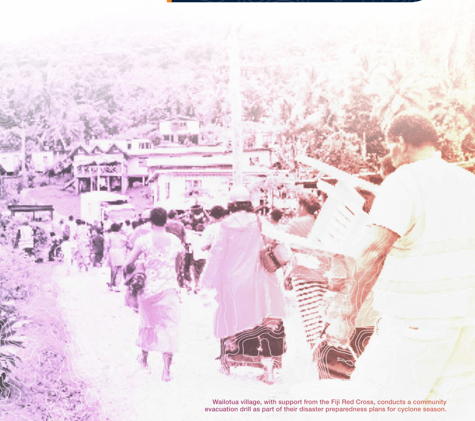
Wailotua village, with support from the Fiji Red Cross, conducts a community evacuation drill as part of their disaster preparedness plans for cyclone season.