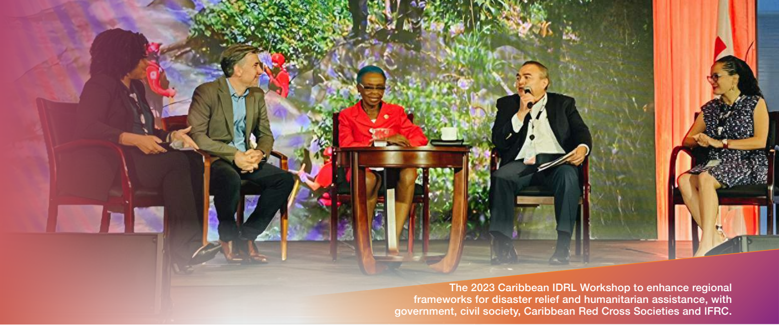
The 2023 Caribbean IDRL Workshop to enhance regional frameworks for disaster relief and humanitarian assistance, with government, civil society, Caribbean Red Cross Societies and IFRC.