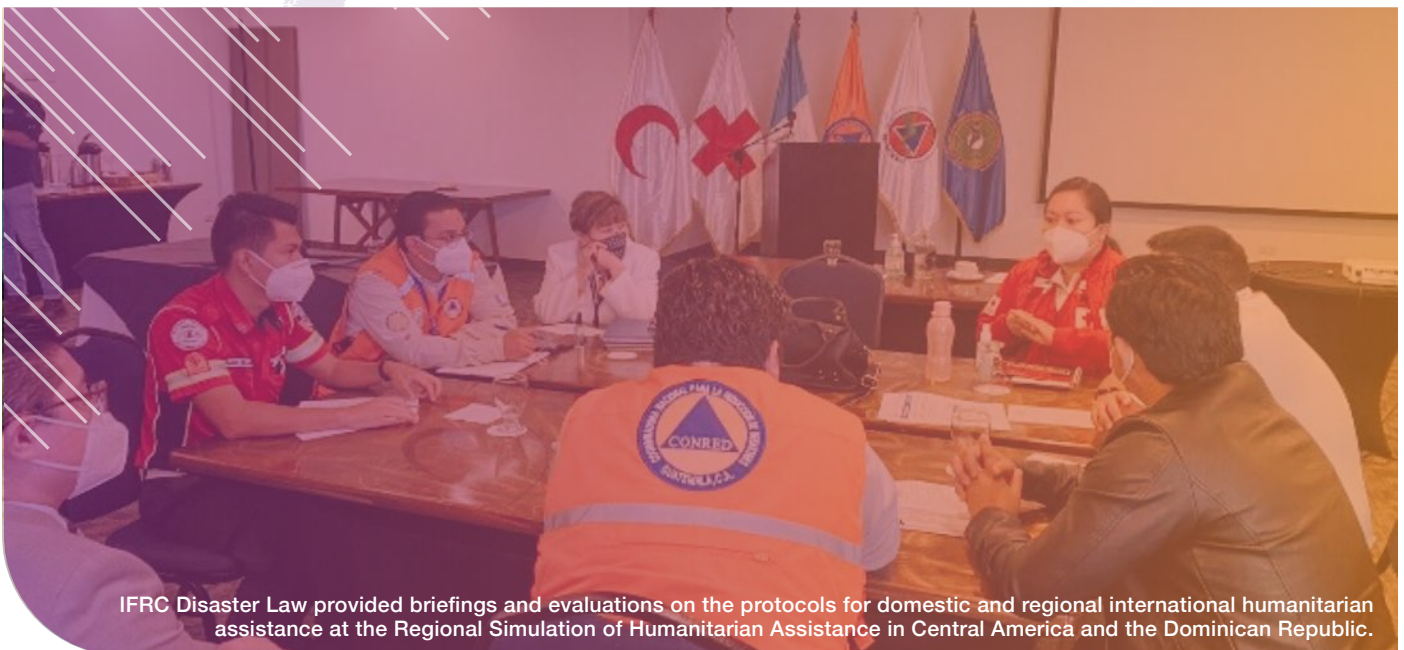
IFRC Disaster Law provided briefings and evaluations on the protocols for domestic and regional international humanitarian assistance at the Regional Simulation of Humanitarian Assistance in Central America and the Dominican Republic.

In Kyrgyzstan, to simplify the regulatory processes involved in the delivery and acceptance of international emergency assistance, the government has introduced