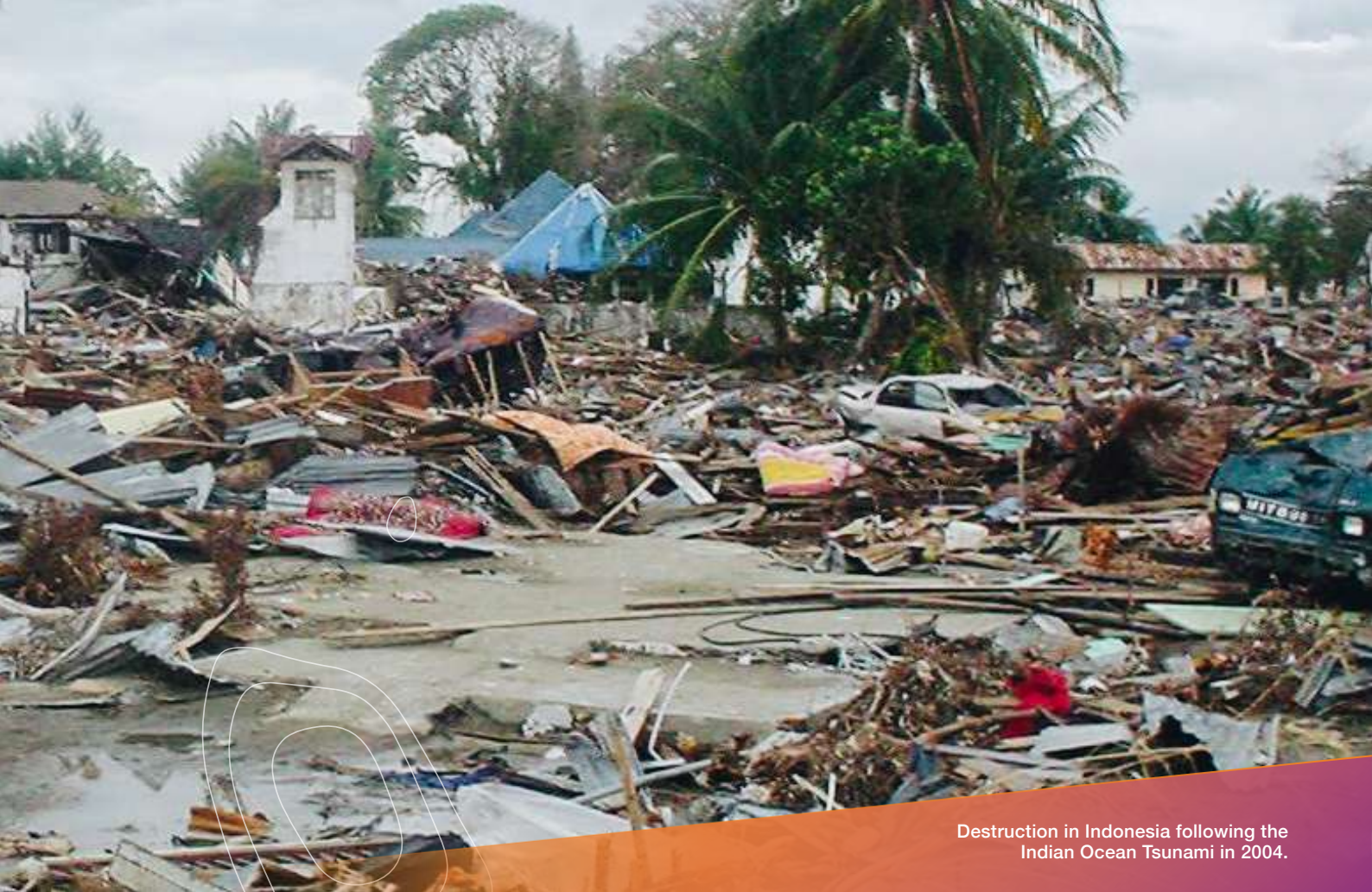
Destruction in Indonesia following the Indian Ocean Tsunami in 2004.

influenced state practice and gained considerable authority since their development. The Guidelines are still widely used by governments to prepare their disaster laws and plans to mitigate the common problems in international disaster response operations today. To date, the IFRC network has supported the implementation of the IDRL Guidelines in domestic instruments in 38 countries, with several adopting more than one instrument reflecting the recommendations of the IDRL Guidelines. The non-binding nature of the Guidelines promotes a flexible approach which allows states to incorporate them into their domestic legal and policy frameworks according to their national priorities and needs.