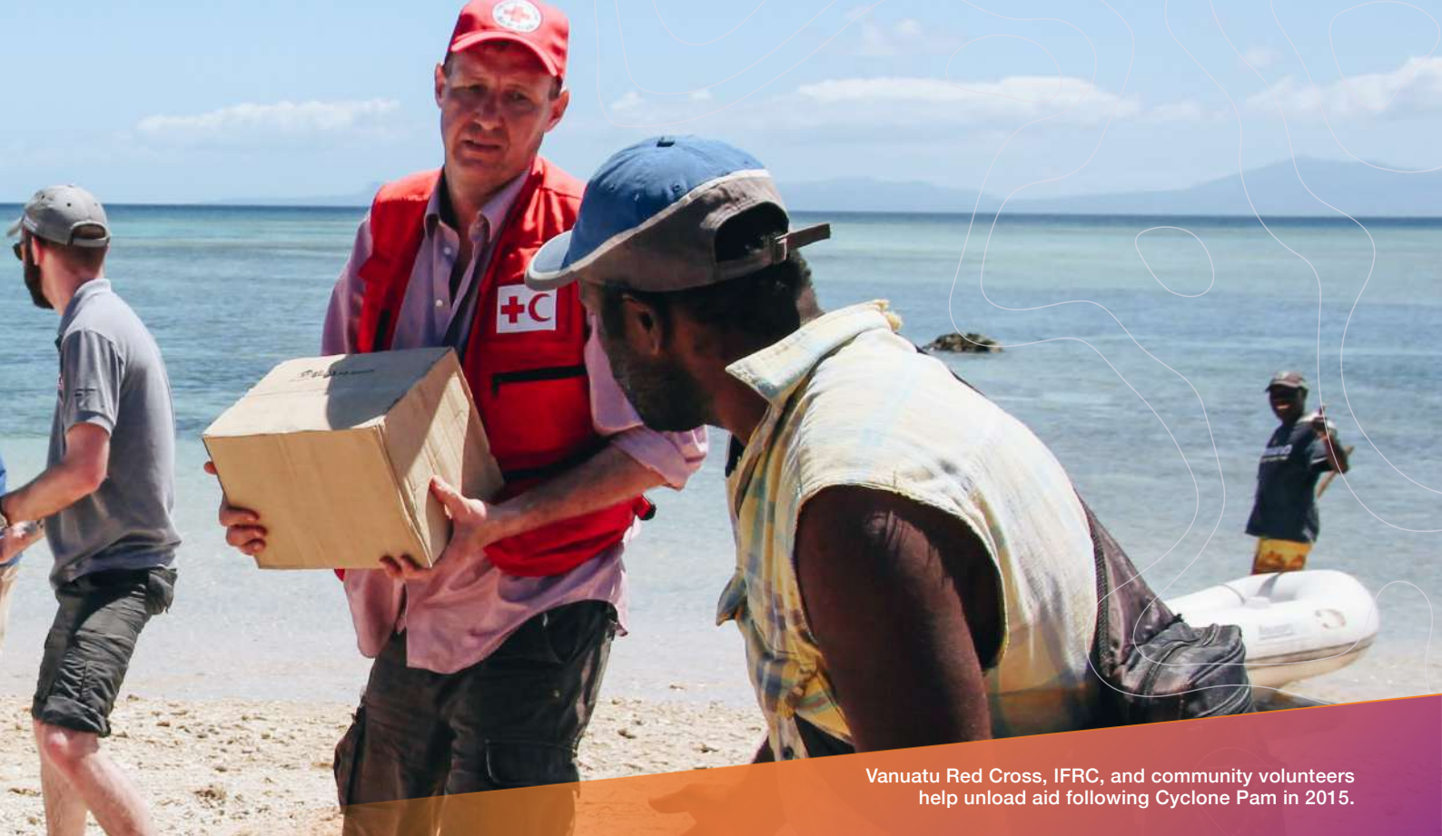
Vanuatu Red Cross, IFRC, and community volunteers help unload aid following Cyclone Pam in 2015.

Cross and IFRC Disaster Law was adopted. One of the objectives of this law was to facilitate the entry and coordination of international assistance, and it includes detailed procedures relating to requests for and offers of international disaster assistance as well as provisions for the coordination of international assisting actors. These provisions will help to avoid the influx of unsolicited and uncoordinated aid and assistance in large-scale disasters.