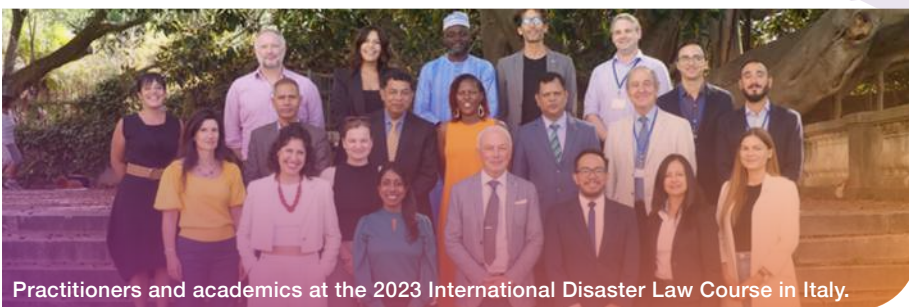
Practitioners and academics at the 2023 International Disaster Law Course in Italy.

Several online training courses on topics such as IDRL, law and disaster preparedness and response and law and disaster risk reduction have been developed to disseminate disaster law amongst National Societies, governments, academics and the general public. In 2023, IFRC Disaster Law, in partnership with the International Disaster, Emergency and Law Network (IDEAL), a global group of disaster law academics and experts, and with the support of the Italian Red Cross, launched the world’s first free online disaster law course, Law and Policies for the Protection of the Most Vulnerable , to increase knowledge of disaster law and how it can help save lives and keep communities safe in disasters.