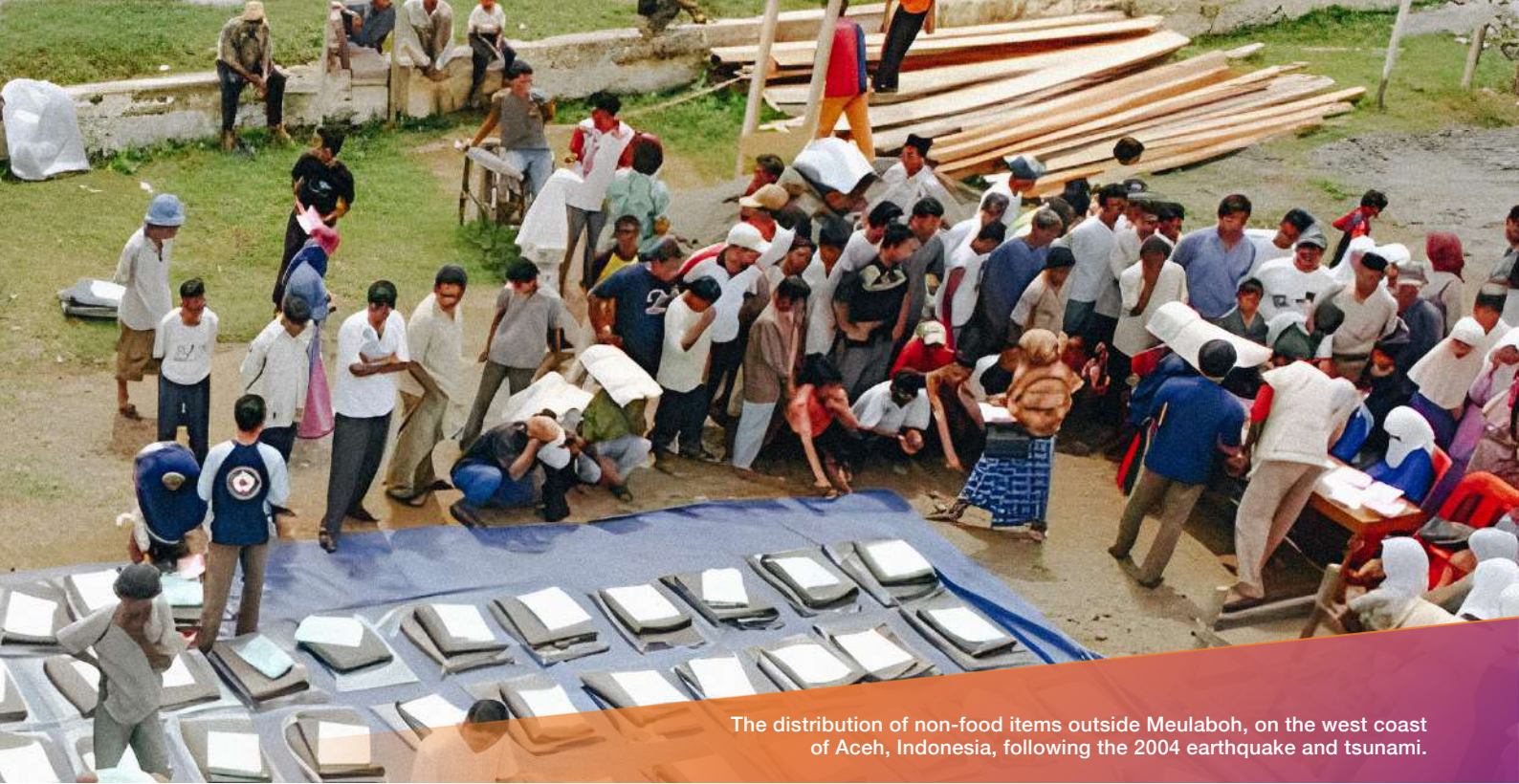
The distribution of non-food items outside Meulaboh, on the west coast of Aceh, Indonesia, following the 2004 earthquake and tsunami.

“One of my first tasks was defining international disaster law, what would be most useful and feasible at the time, thinking about how it might expand in the future, but we had to have a starting point.