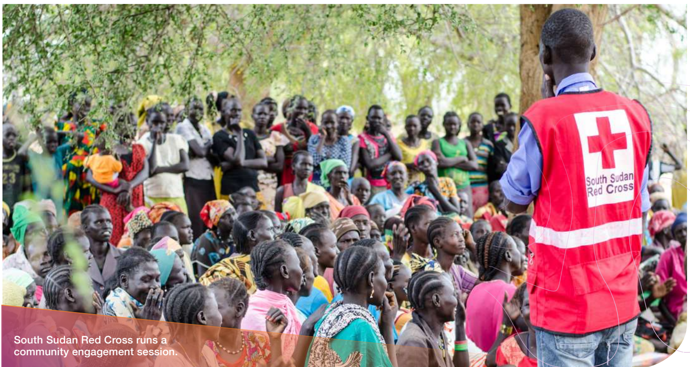
South Sudan Red Cross runs a community engagement session.

This research is a key element to advocate for and ultimately inform legal reform.