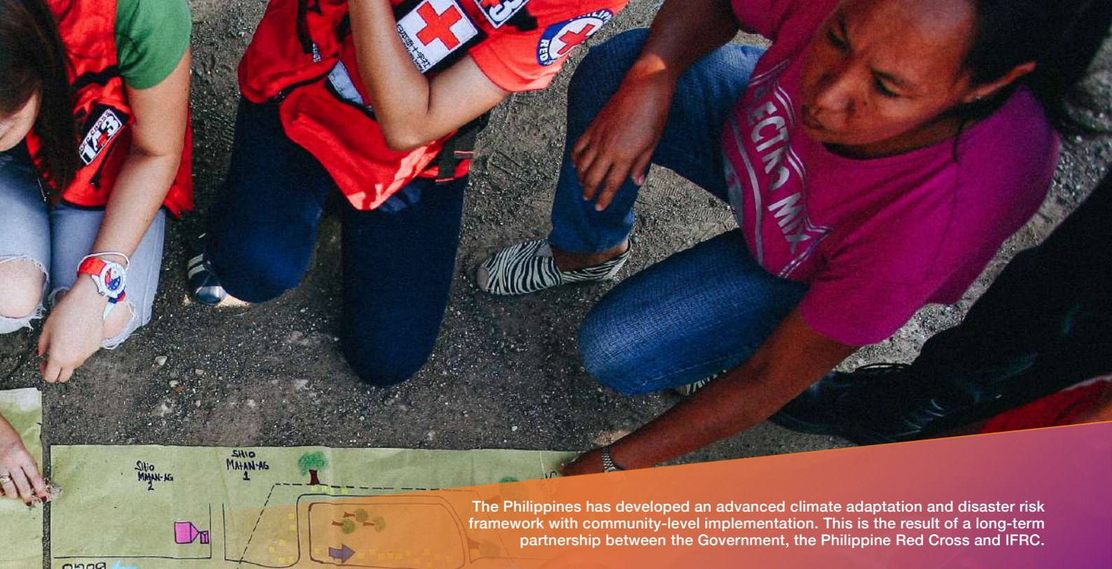
The Philippines has developed an advanced climate adaptation and disaster risk framework with community-level implementation. This is the result of a long-term partnership between the Government, the Philippine Red Cross and IFRC.

solutions are community-based solutions, and local actors, including Red Cross volunteers, should be at the core of its design and implementation.”