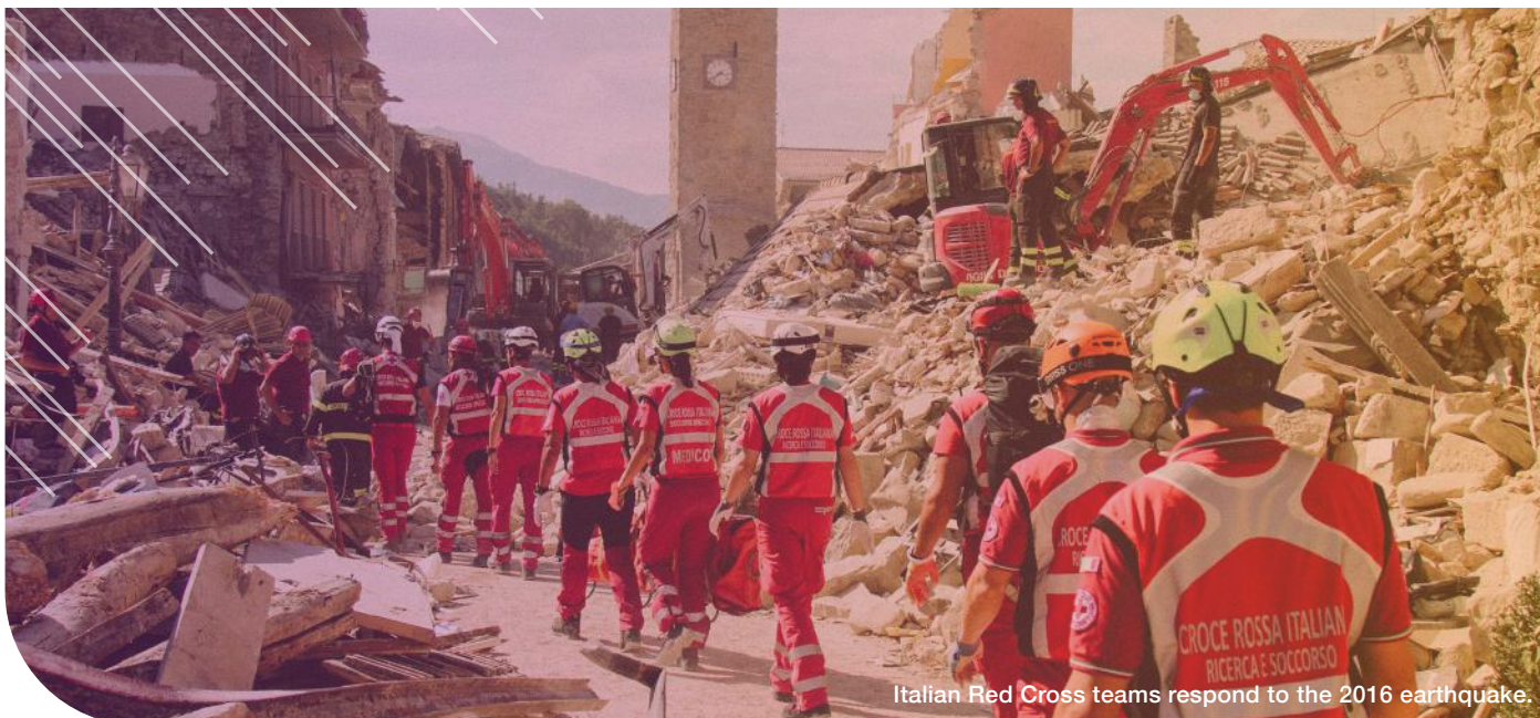
Italian Red Cross teams respond to the 2016 earthquake.