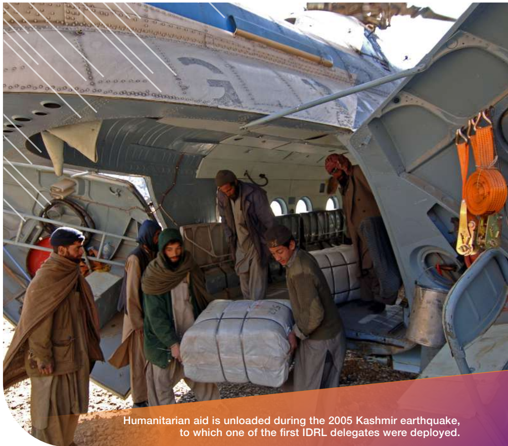
Humanitarian aid is unloaded during the 2005 Kashmir earthquake, to which one of the first IDRL delegates were deployed.